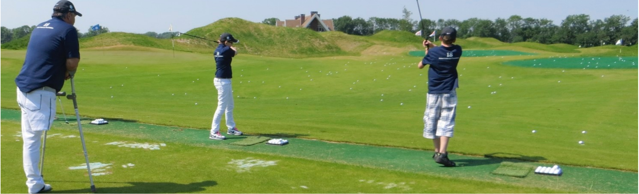
Clinics per year