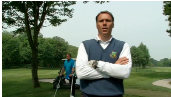
Marco van Basten - ambassador of Robert Kalkman Foundation

To ensure continuity the foundation is always seeking for new funding opportunities. Please contact us if you are interested to become an ambassador or sponsor.